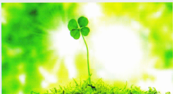
Developing a Sustainable Future

The Science and Technology Congress (MSTC) is the major event of COSTAM and has been held for nearly three decades. The Congress is to showcase the scientific and technological research activities in the country, especially under the MOSTI research grants and the Scientific Advancement Fund Allocation for Fundamental Science Research (SAGA), and also related to the Malaysian Development Plan. As an umbrella of the major scientific professional bodies, it has the objective to promote the research and development in term of the findings of the institutions of higher learning plus the research and development centres to the general public and also as a tool of communication among the scientists, engineers and technologists.